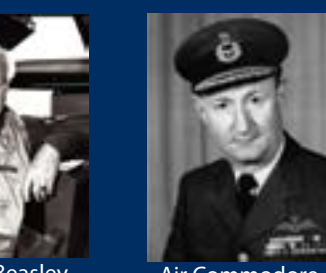
Air Commodore Leonard Joseph Birchall